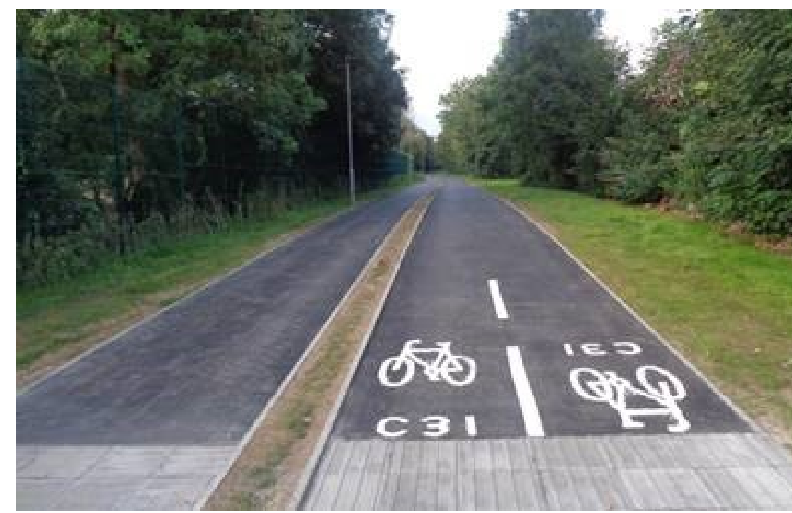
Example of a fully segregated two-way cycle track