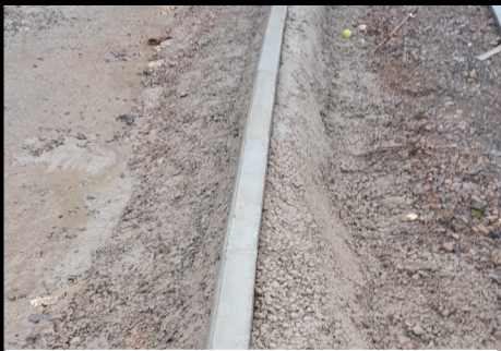
New kerbing has been installed on site