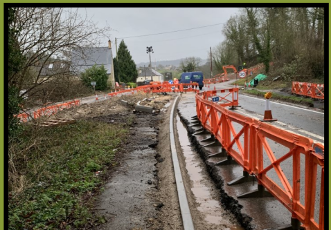
New kerbline completed on footpath alongside the A4173