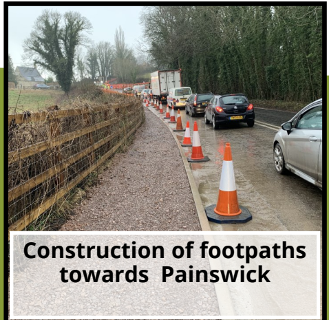
Construction of footpaths towards Painswick