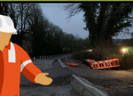
Kerbing and temporary access installed on the A46