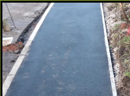
Completed footpath along the A46