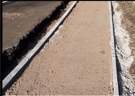
New footpaths to Gloucester have been installed