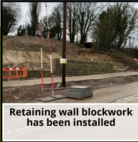
Retaining wall blockwork has been installed