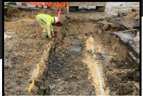
Protection works to the live underground services