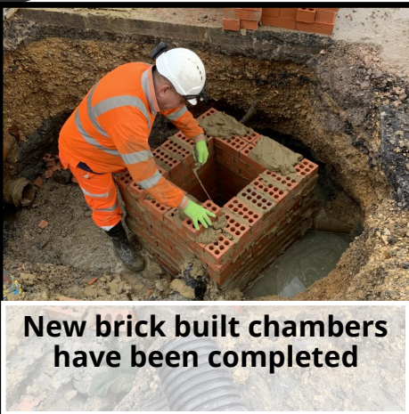
New brick built chambers have been completed