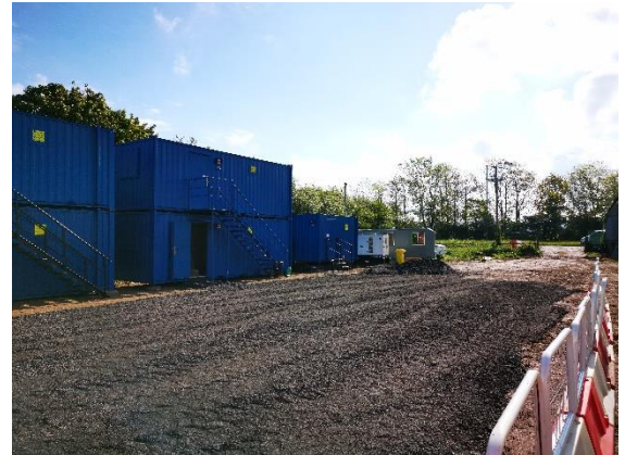
Set up of the compound is underway

To allow us to carry out this work safely we will be reducing the speed limit to 40mph over the entire site, which will remain for the duration of the scheme. The first two weeks will involve working within the Cross Keys Roundabout island to reduce its overall size, preparing for the new inside lanes. We will install temporary cones and barriers along the perimeter of the roundabout until we can put in the new kerb line and provide a temporary surface for vehicles to use when we move to the outside of the roundabout.