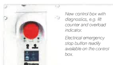
New control box with diagnostics, e.g. lift counter and overload indicator.