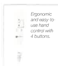
Ergonomic and easy-to-use hand control with 4 buttons.

MiniLift200 meets the requirements of the Medical Devices Directive for Class 1 products 93/42/EEC