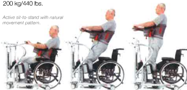
Active sit-to-stand with natural movement pattern.

MiniLift200 has been developed to, as gently and comfortably as possible, assist the user when rising from a sitting to a standing position. The handles and the side supports offer multiple hand placement options for the user. The stable anti-slip foot plate is very low and the lower leg supports, as well as the lifting arm, can be adjusted to fit every user optimally. When MiniLift200 is used in combination with the appropriate lifting accessories, the user is supported under the feet, for the front of the lower legs and behind the back, which provides for a safe and secure, yet active sit-to-stand procedure. The construction safely moves the user forwards and upwards in a natural movement pattern and, at the same time, the leg muscles and balance are exercised. MiniLift200 is manufactured in steel for stability and strength and is suitable also for tall and heavy users weighing up to 200 kg/440 lbs.