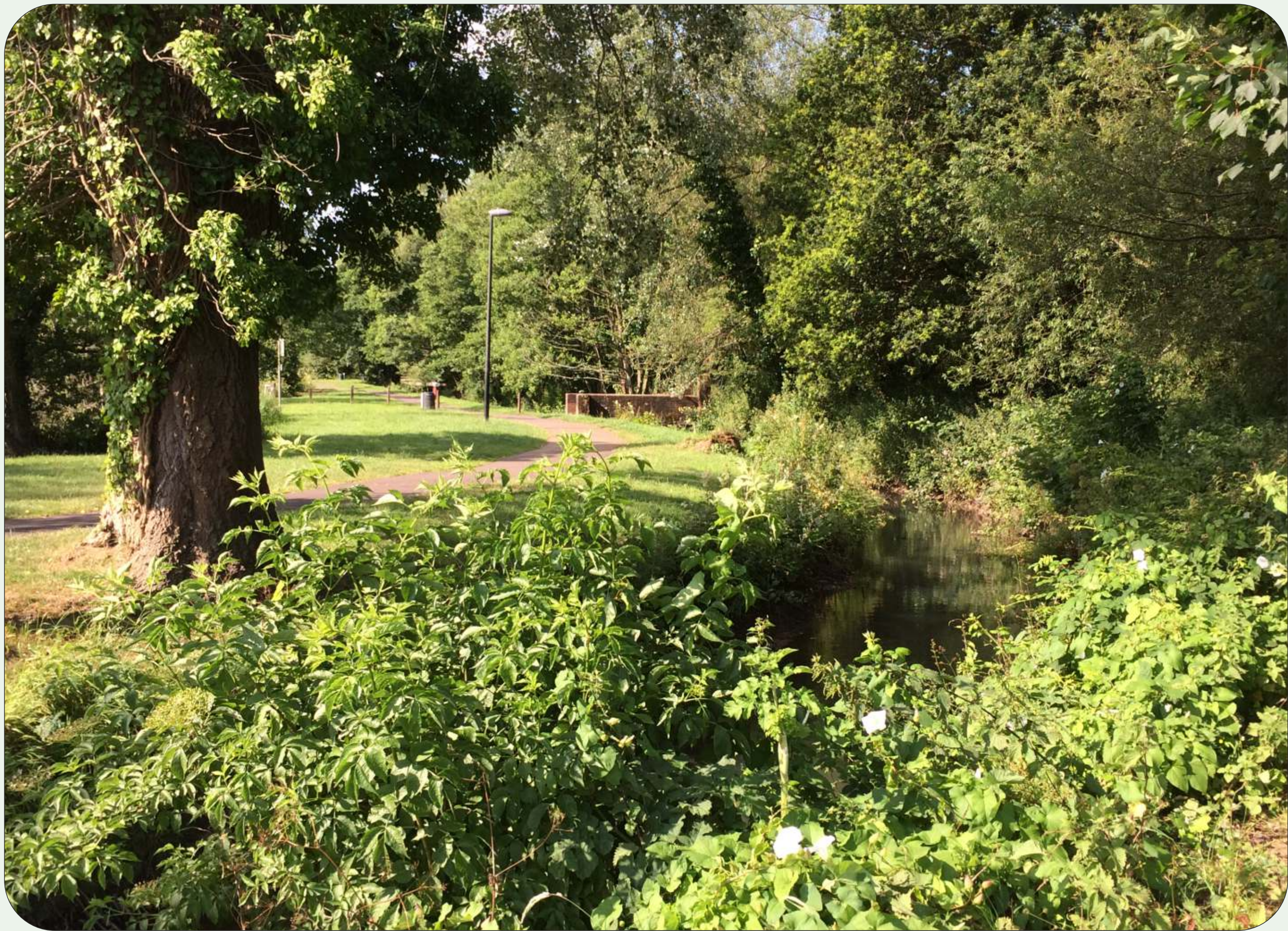
Proposed Location of new cycleway bridge - Lydney Trust Recreation Ground