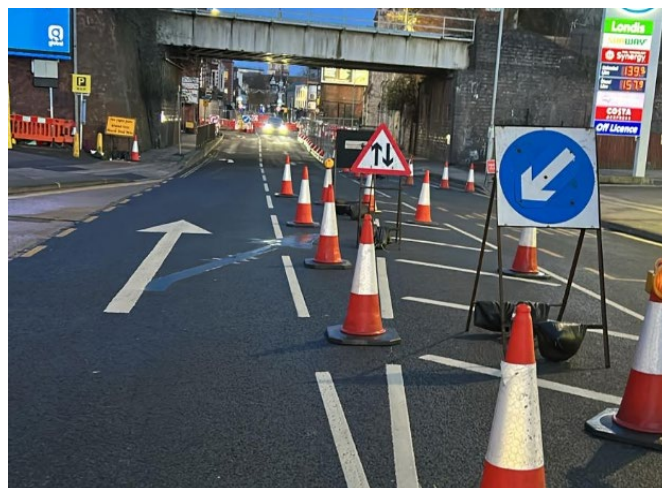
London Road before the bridge

If you have any specific queries, concerns or would like to be added to the mailing list: Please contact: blackdogway@montel-group.com