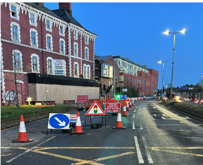
Black Dog Way

As part of our wider social values commitments, we will be working with local community groups, charities and schools. Much of our focus will be on the area closest to the site, but if there are any local community groups interested in working with us, please contact us on blackdogway@montel-group.com