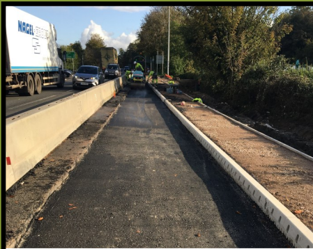
Installation of temporary footpath