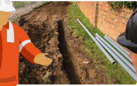
Installation of BT ducts