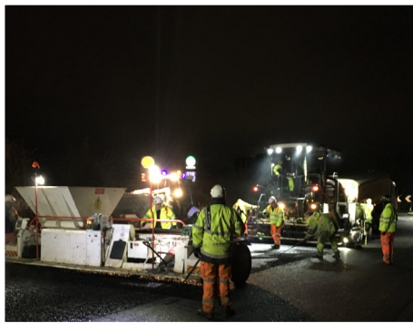
Surfacing works at Chipmans Platt