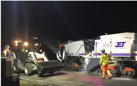
Planing works being undertaken