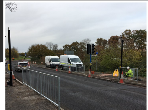
Installation of toucan crossing & guard rails