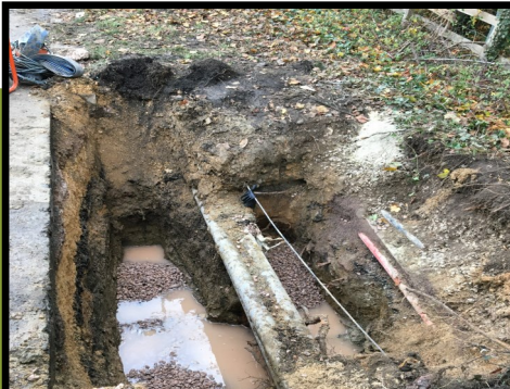
Drainage repair works have been undertaken