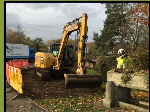
Earthworks have commenced on site.