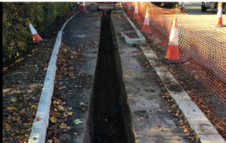
Energetics ducts installation