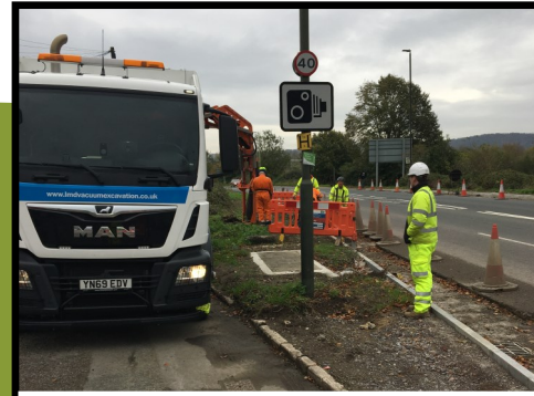
Sewer Trent Water Diversion works