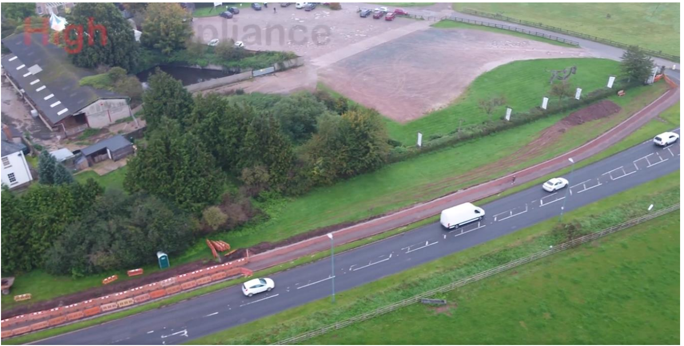
We have also widened the existing footway at the southern end of Lydney toward the town centre