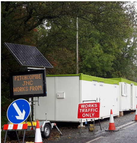
OUR SITE OFFICES HAVE BEEN INSTALLED

Over the next few weeks you should see a rapidly changing landscape. Drainage will be installed along the southern A46; the island between the A4173 and the A46 will start to be rebuilt, new street lighting will be put in, and the new footpath will start to take shape.