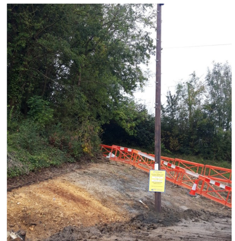
REPOSITIONING OF BT COLUMN