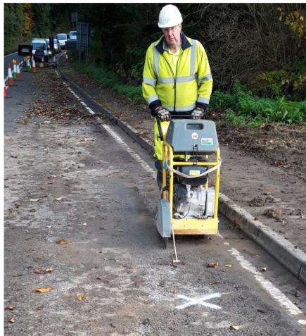
WIDENING WORKS HAVE STARTED ON THE A1473