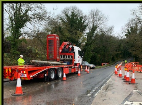
Removal of the vehicle activated signs and phone box