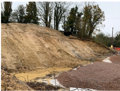
Gas main protection works have been undertaken