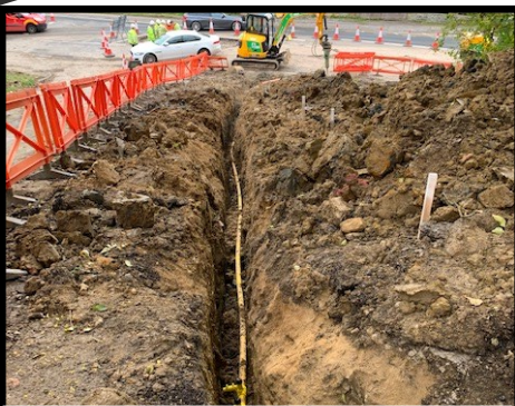
Gas diversion works at Halfway Pitch