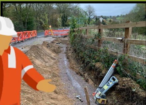
Street light ducting being installed