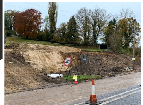
Retaining wall excavation works