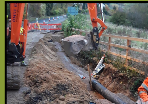
Drainage and ducting along the A46 footpath