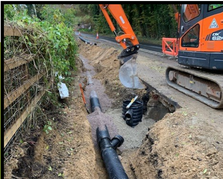
Drainage works undertaken along the A46