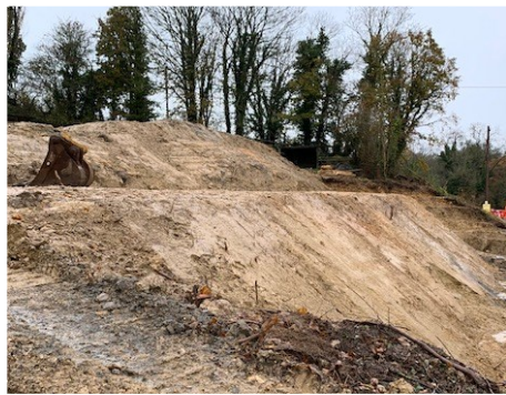
Material storage for retaining wall excavation