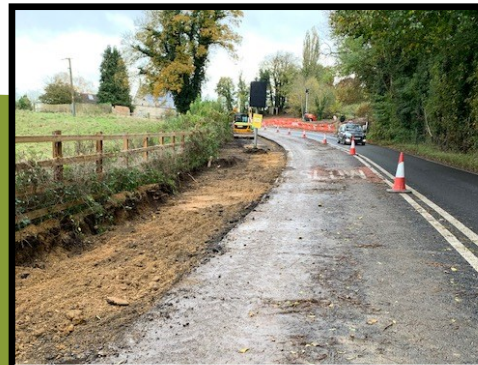
Excavated footpath and kerbs