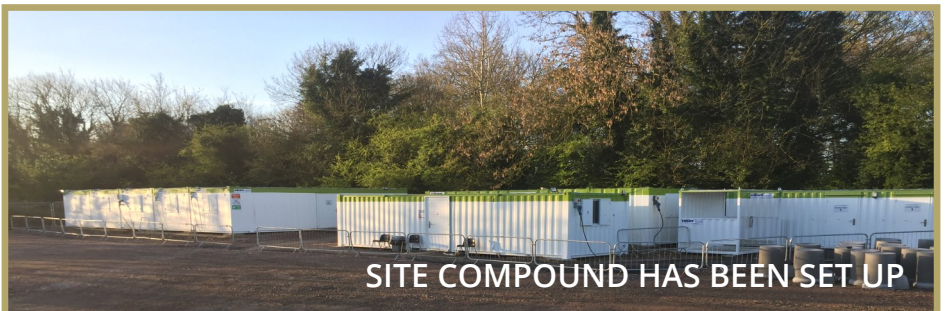
SITE COMPOUND HAS BEEN SET UP