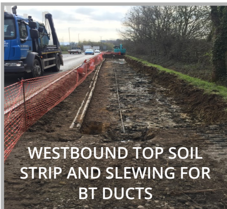
WESTBOUND TOP SOIL STRIP AND SLEWING FOR BT DUCTS