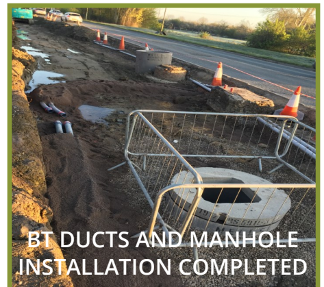
BT DUCTS AND MANHOLE INSTALLATION COMPLETED