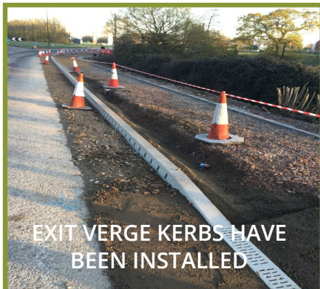
EXIT VERGE KERBS HAVE BEEN INSTALLED