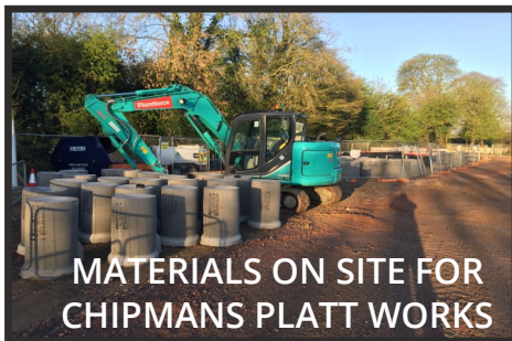
MATERIALS ON SITE FOR CHIPMANS PLATT WORKS

We are currently on programme and progressing well with works.