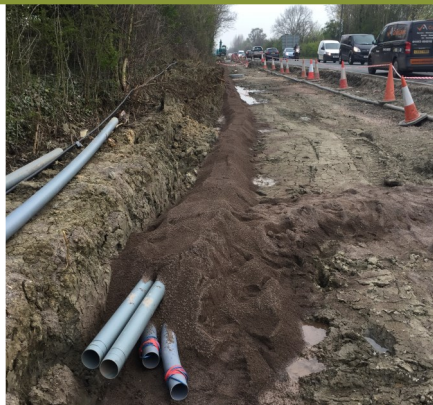
BT DUCTS IN WESTBOUND VERGE