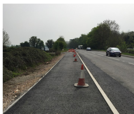
EASTBOUND FOOTPATH & CARRIAGEWAY WIDENING AFTER SURFACING