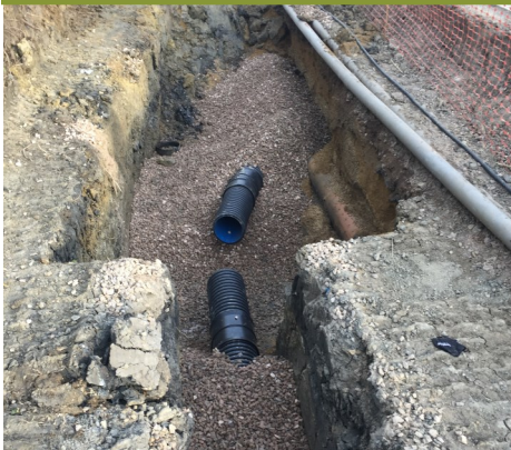
DRAINAGE WORKS IN WESTBOUND EXIT VERGE