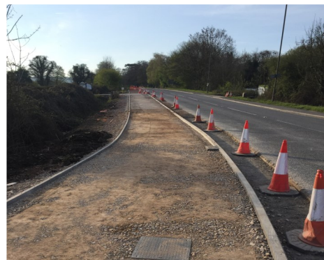
EASTBOUND FOOTPATH & CARRIAGEWAY WIDENING BEFORE SURFACING