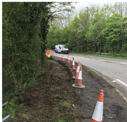
SPRING HILL ROAD FOOTPATH WIDENING WORKS

https://www.gloucestershire.gov.uk/highways/major-projects-list/a419-highway-improvements/