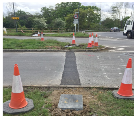
STREET LIGHTING CROSSING & CHAMBER ON GROVE LANE