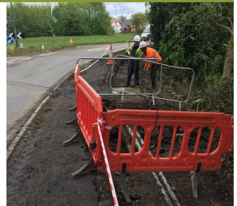
BT INSTALLING NEW CABLES ON SPRING HILL ROAD