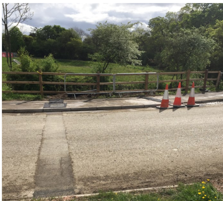
STREET LIGHT ROAD DUCT CROSSING & ROAD DRAINAGE GULLY ON GROVE LANE