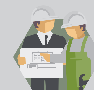
BUILD OPEN & HONEST RELATIONSHIPS