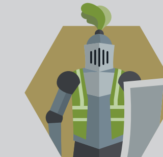
INSPIRE CONFIDENCE & ADMIRATION