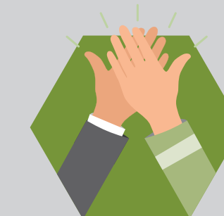
FOSTER TEAM SPIRIT

Knights Brown is a modern and innovative construction and civil engineering company with over 60 years' experience within the industry. We have divisional offices in Ringwood, Rochester and in Bridgend, South Wales. We employ over 250 direct employees and deliver complex civil infrastructure and energy schemes throughout the UK.