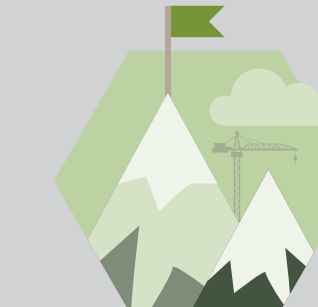
FACE CHALLENGES WITH ENTHUSIASM