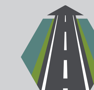
ADD VALUE THROUGH SIMPLICITY