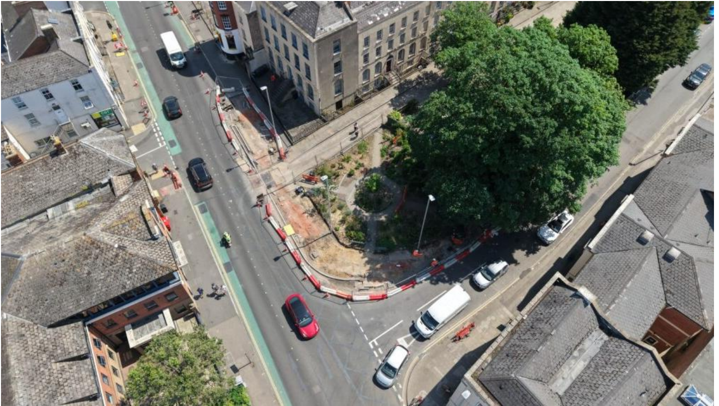
Phase 3A1 - Aerial view of London Road and Great Western Road

If you have any specific queries, concerns or would like to be added to the mailing list: Please contact: blackdogway@montel-group.com