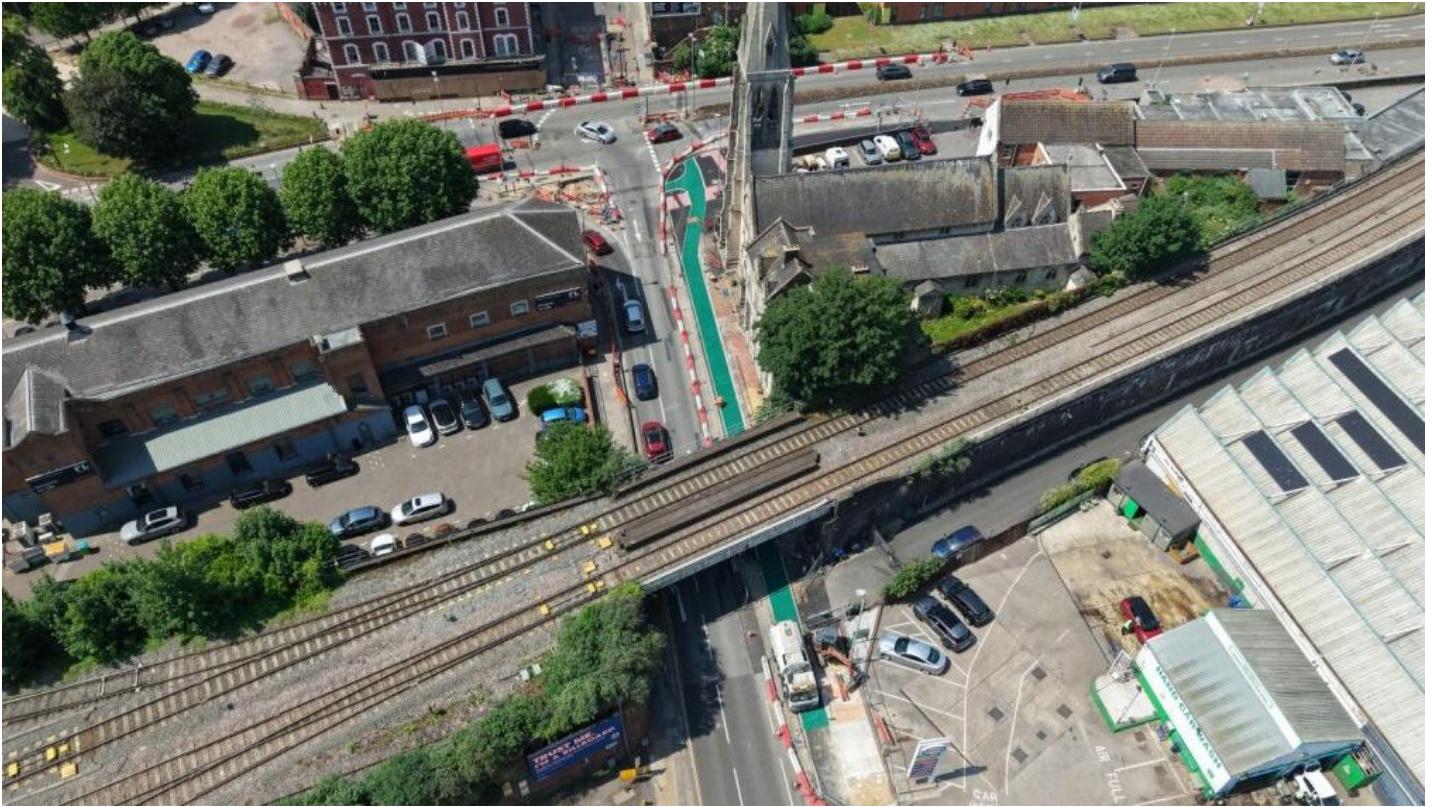
Phase 2 - Aerial view of London Road approaching Black Dog Way

If you have any specific queries, concerns or would like to be added to the mailing list: Please contact: blackdogway@montel-group.com