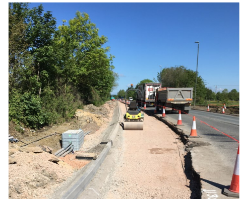
PREPARATION ON WESTBOUND EXIT FOR SURFACING WORKS