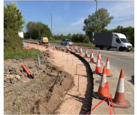
PREPARATIONS FOR THE NEW KERBS ON THE WESTBOUND EXIT HAVE STARTED

This traffic management system will remain in place for the next month.