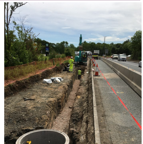
DRAINAGE WORKS ON THE EASTBOUND APPROACH