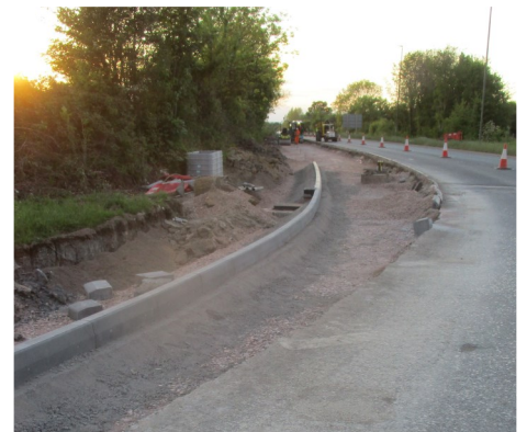
INSTALLATION OF KERBING ON WESTBOUND EXIT