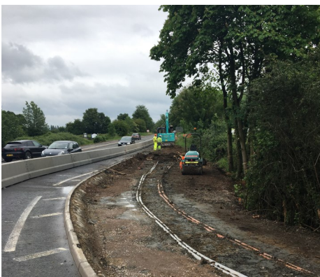
AN INITIAL DIG WAS COMPLETED ON THE WESTBOUND APPROACH TO UNCOVER SERVICES