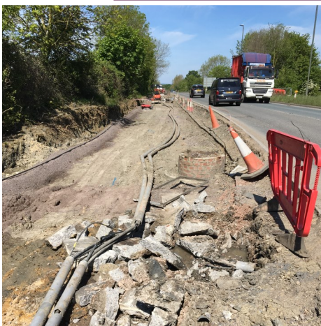
REMOVAL OF OLD BT DUCTS FROM THE WESTBOUND EXIT

24 hour emergency contact - 07544 531851