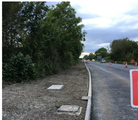
WESTBOUND EXIT SURFACING COMPLETED AND BACKFILLED VERGE