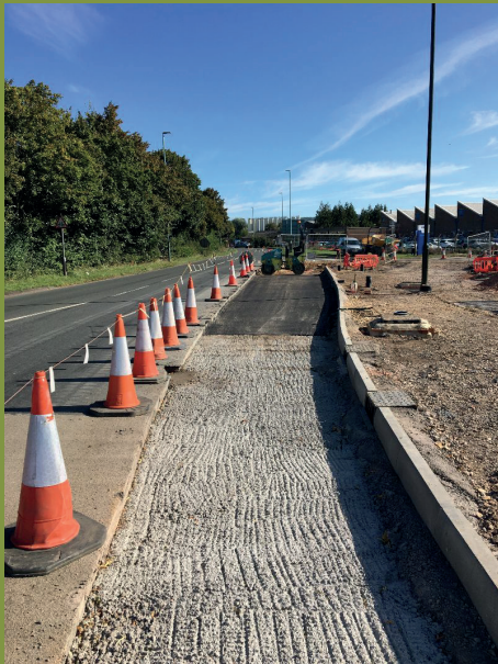
Widening works undertaken at Oldends Lane

Service diversion works will begin at Horsetrough roundabout over the next few weeks. This work will not require traffic management and should cause minimal disruption.