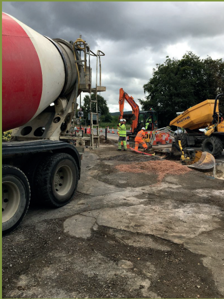
Concrete delivery for kerbs