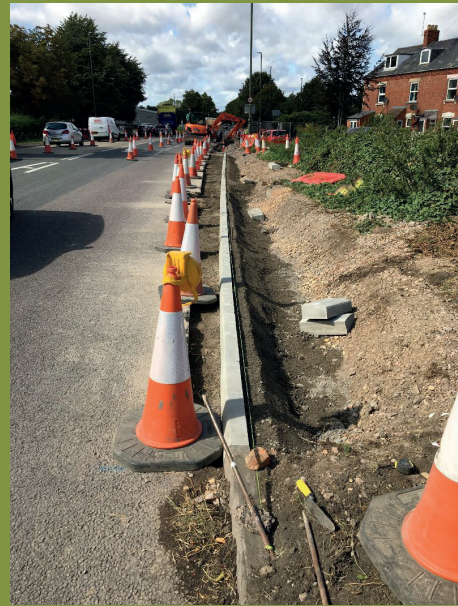
New kerb line on eastbound exit