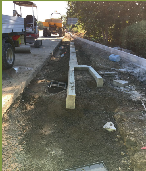
Works undertaken to form the new cycleway entrance at Old Ends Lane

This Information has been sent to you on behalf of the A419 Highway Improvement Scheme Project Team