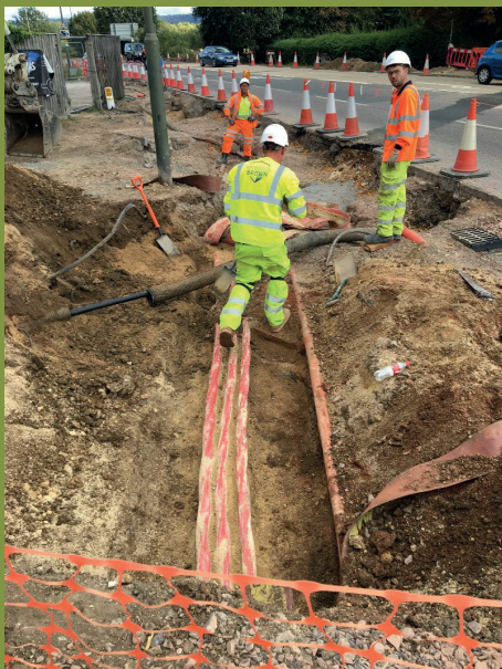
Joint pits have been completed for HV electrical diversions