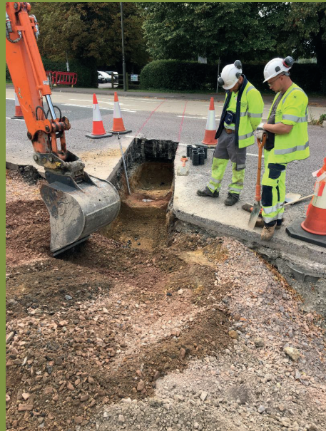
Excavation work has been completed for new ducts