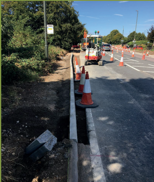
New kerb line installed on westbound approach