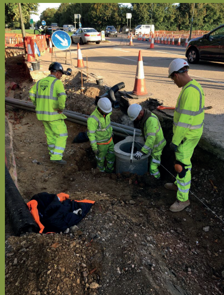
Installation of drainage gullies at Old Ends Lane