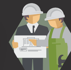
BUILD OPEN & HONEST RELATIONSHIPS