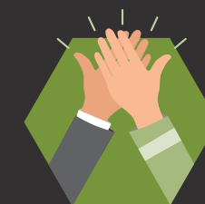
FOSTER TEAM SPIRIT