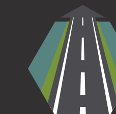
ADD VALUE THROUGH SIMPLICITY