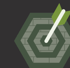
TAKE PRIDE IN SUCCESS

www.gloucestershire.gov.uk/highways/major-projects-list/a419-highway-improvements/