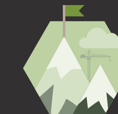
FACE CHALLENGES WITH ENTHUSIASM