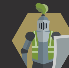
INSPIRE CONFIDENCE & ADMIRATION