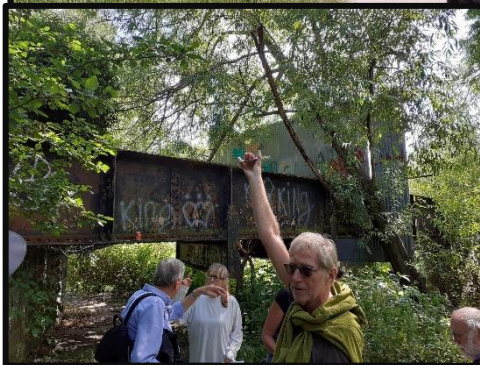
Figure 4 The Brunel Bridge (disused and in disrepair)