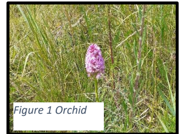
Figure 1 Orchid