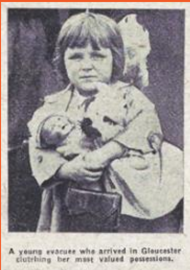
A young evacuee who arrived in Gloucester clutching her most valued possessions.

Cute photo from our collections of a cat who decided to 'adopt' an orphaned pair of fox cubs. It's not just humans who are 'programmed' to care for others.