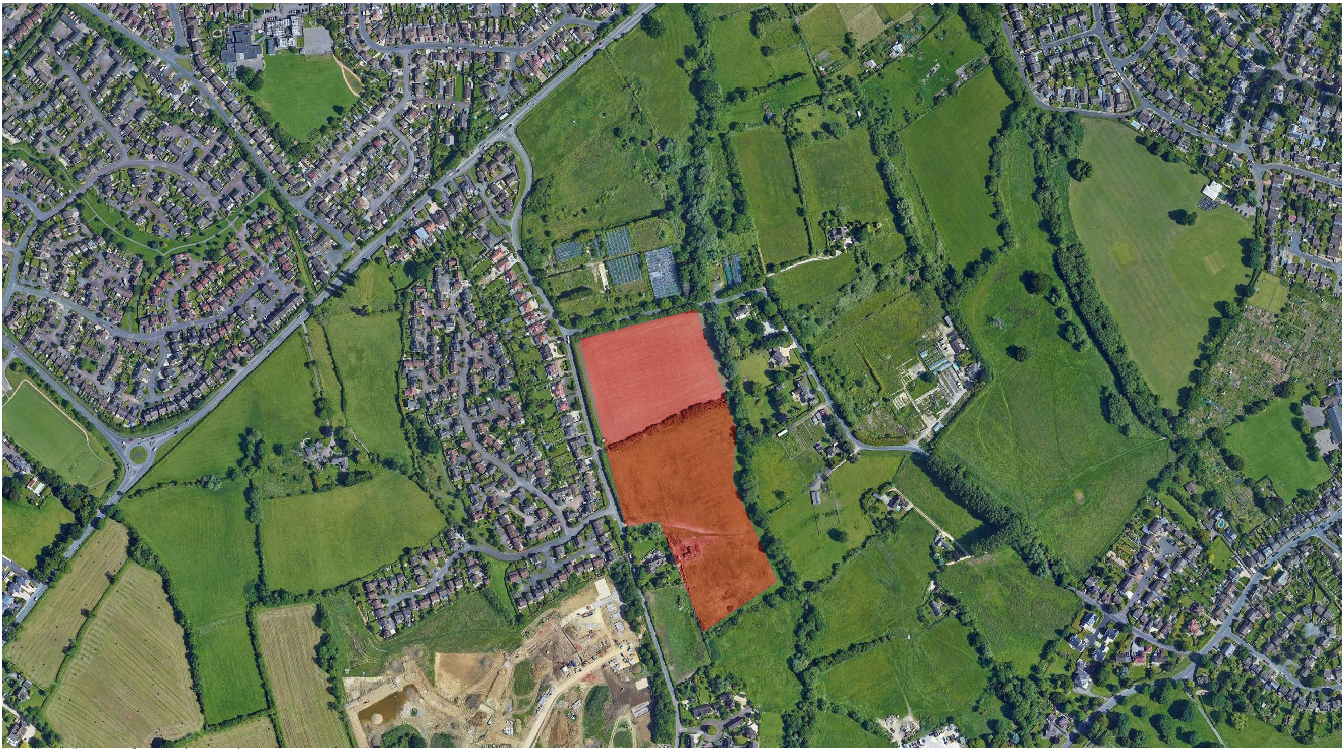
Localised diagram of areas close to site