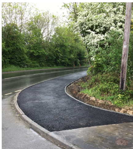
SPRING HILL ROAD FOOTPATH AFTER SURFACING