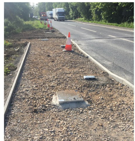
A419 EASTBOUND VERGE TOUCAN CROSSING SOCKETS INTALLED