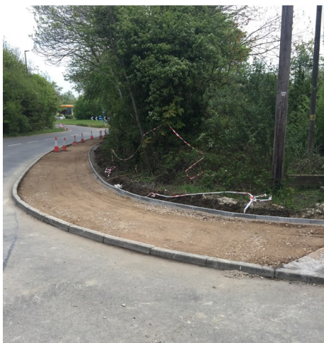
SPRING HILL ROAD FOOTPATH BEFORE SURFACING

24 hour emergency contact - 07544 531851