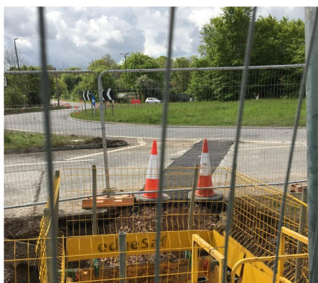
MANHOLE BEING INSTALLED FOR IMPROVED DRAINAGE